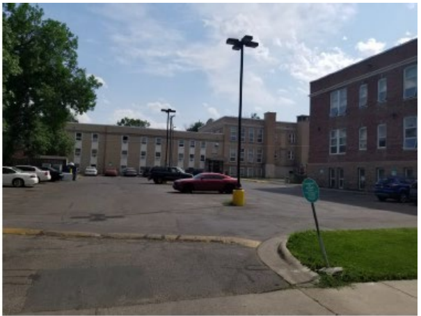
Subject exterior and off-street parking