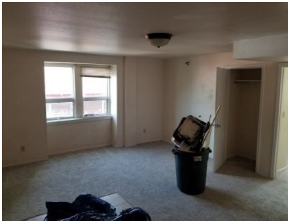
Typical living room