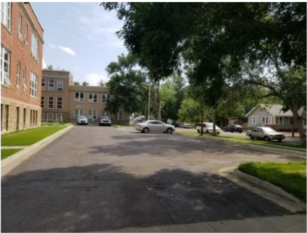
Subject exterior and off-street parking