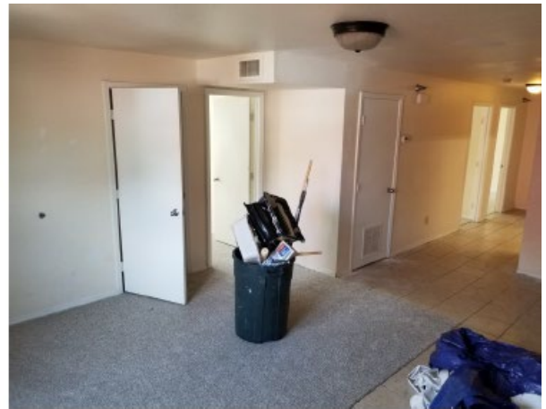
Typical living room