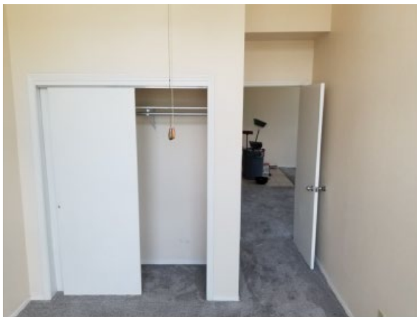
Typical bedroom closet