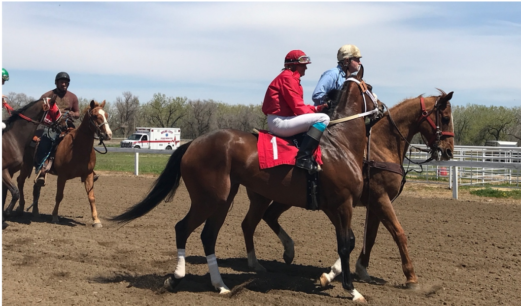
Horses coming onto the track for race 1 in Miles City - 2019

Nine days have been allocated for the 2021 season. Everyone is anxious for the season as people are ready to get outside and enjoy horse racing once more. Miles City will also simulcast in the Kentucky Derby and will be racing on Derby day for the first time ever. Great Falls has been working on their facility and with their new grandstand, lots of improvements await their loyal fans. Miles City Buck Horse Sale Race Meet is schedule to run May 1, 9, 15 & 16. State Fair Race Meet in Great Falls will race on July 24, 25, 30, 31 & August 1 st . Funds to be distributed to the race meets in 2021 must be split between purses and operations. Those distribution amounts are: Miles City - $65,000 and Great Falls - $110,000.