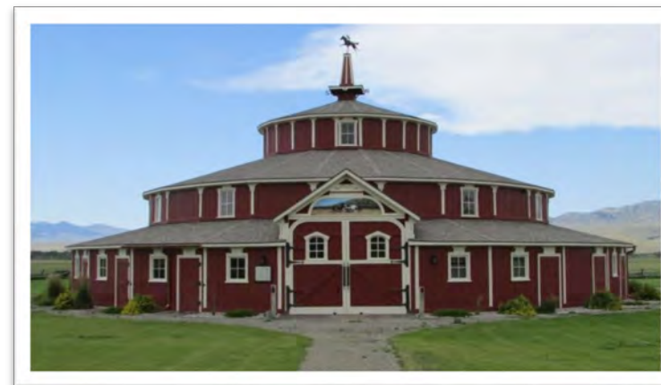
Historic Montana Ghost Towns and History of Montana – Montana Historical Society