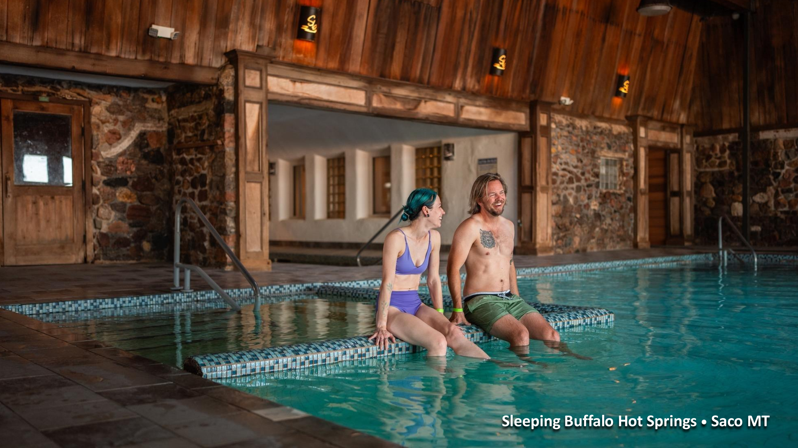
Sleeping Buffalo Hot Springs • Saco MT