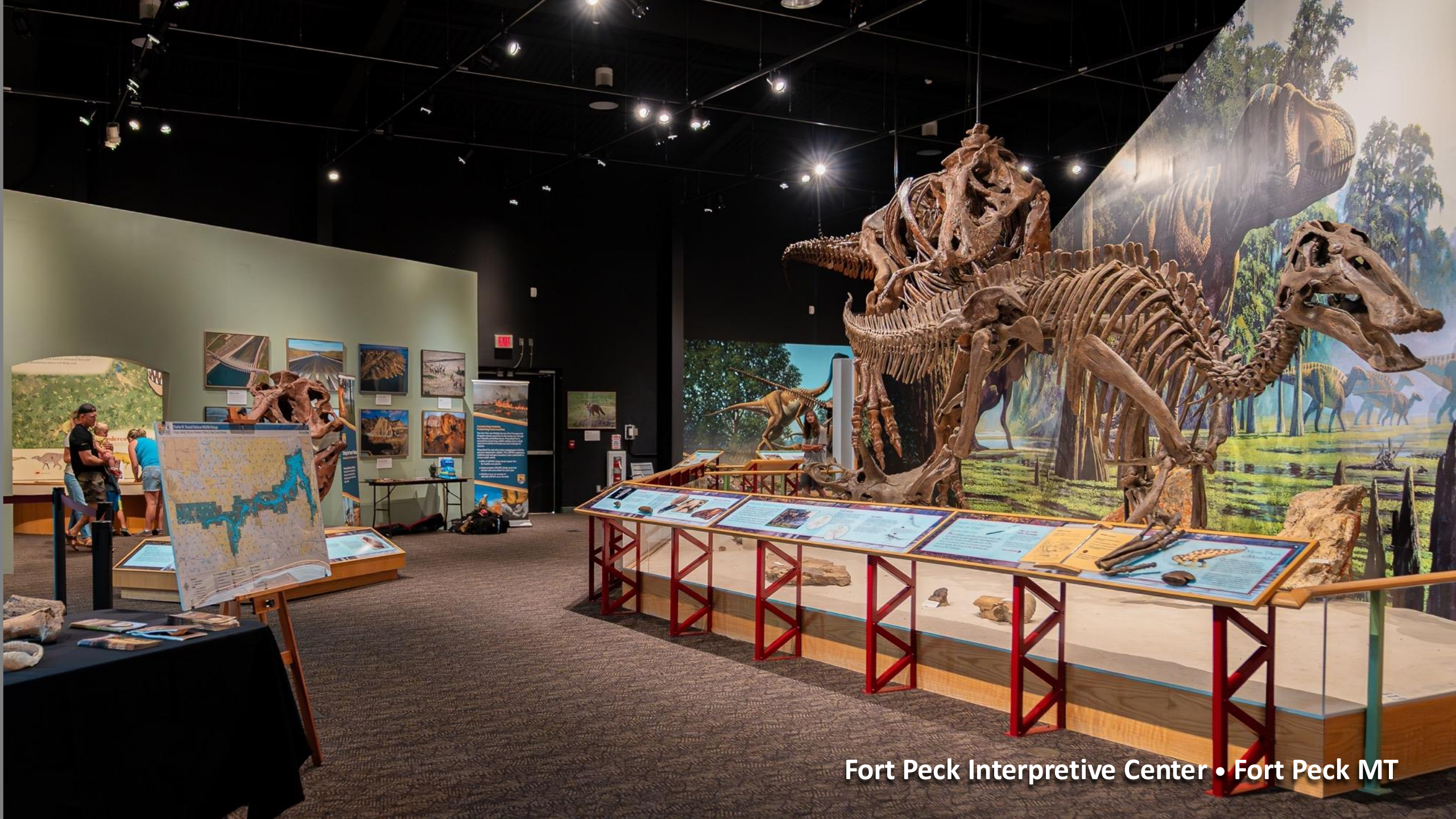
Fort Peck Interpretive Center • Fort Peck MT