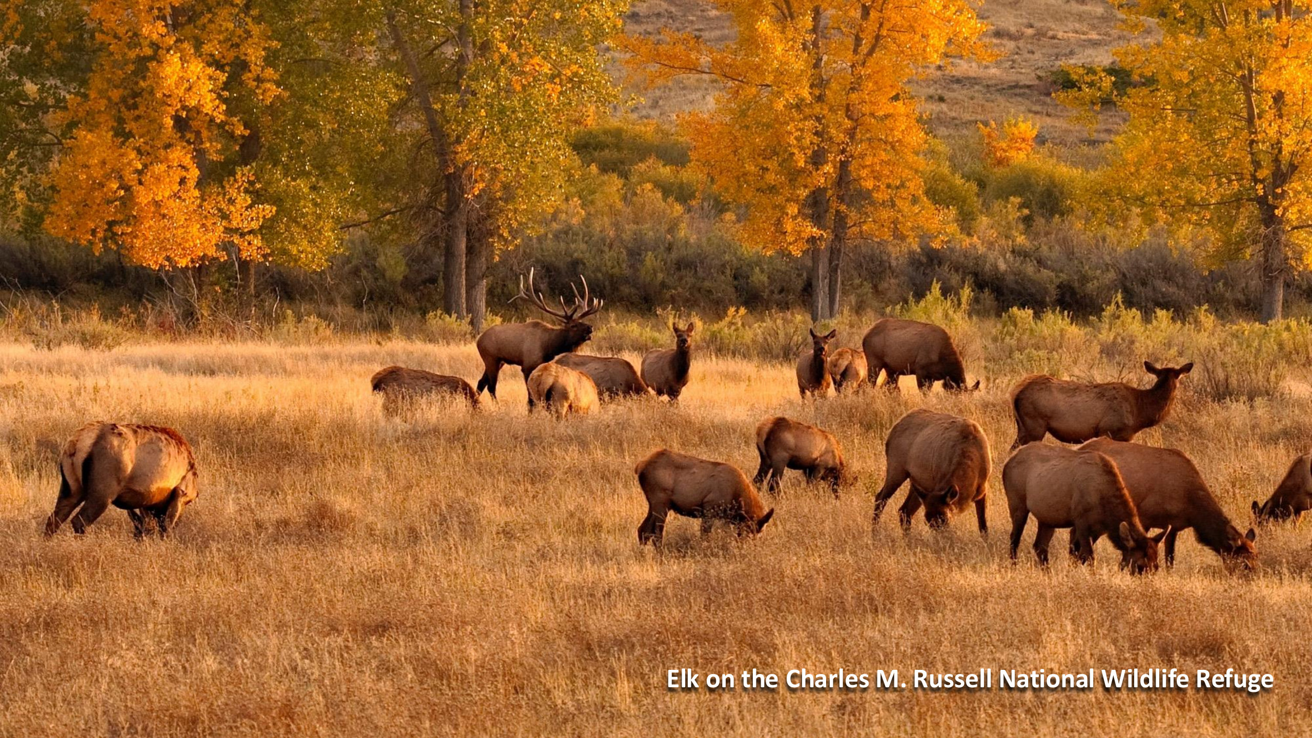
Elk on the Charles M. Russell National Wildlife Refuge