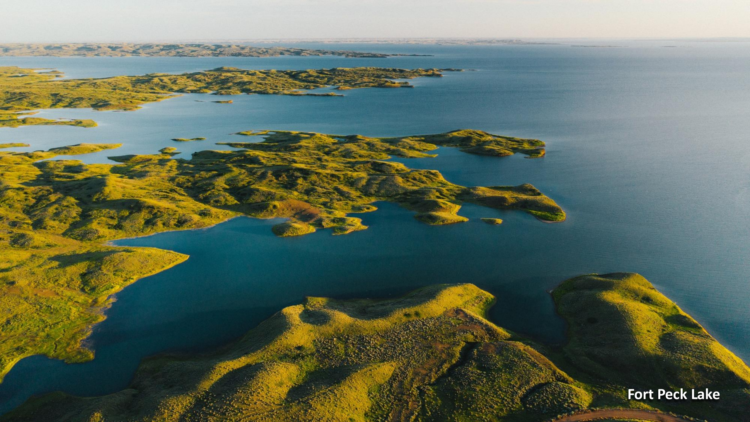
Fort Peck Lake