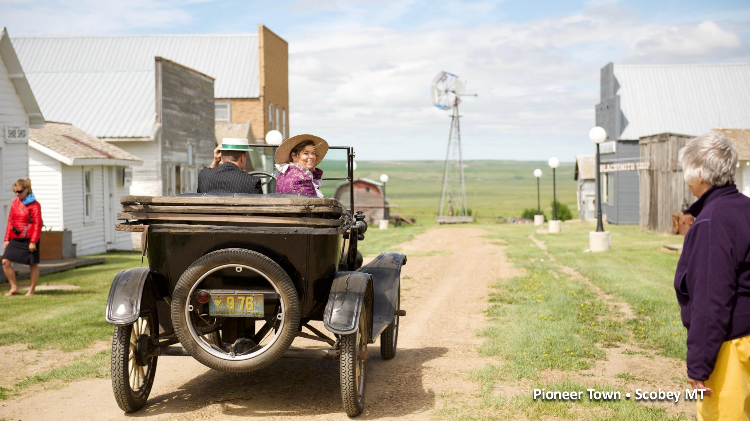
Pioneer Town • Scobey MT