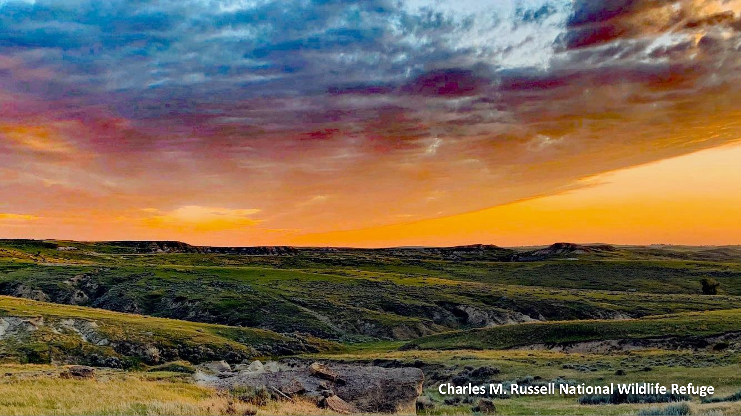
Charles M. Russell National Wildlife Refuge