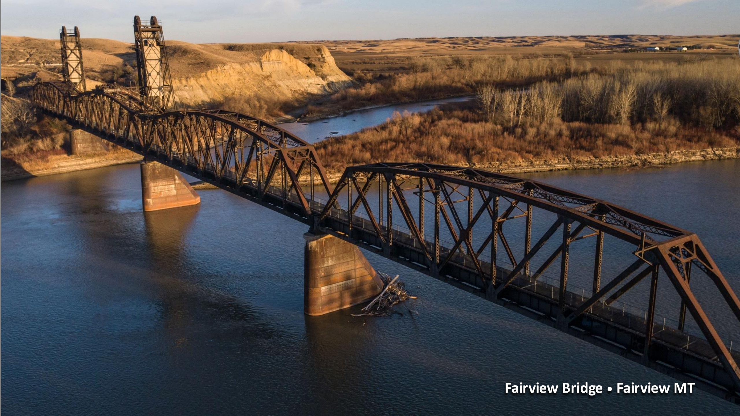
Fairview Bridge • Fairview MT