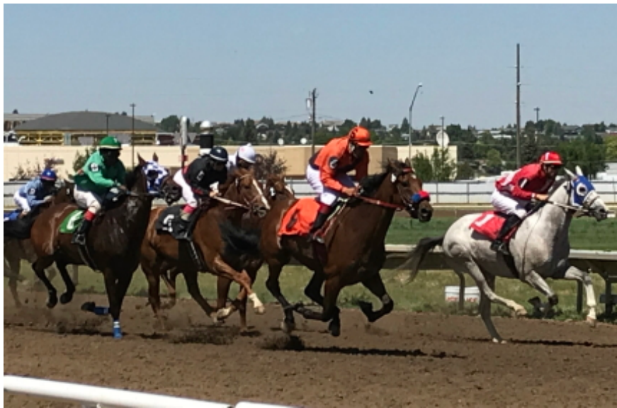
Horses racing from the starting gate in Great Falls

Eight days have been allocated for the 2020 season. In 2019, rain caused major problems for the race meet in Miles City. Miles City had purchased additional equipment and placed more sand on their track, but the weather proved to be too much. Great Falls experienced a drop in their handle and attendance in 2019 due to the new grandstand and some of the facilities not completed. In 2020, the Great Falls Turf Club hopes to bounce back. In 2020, three days are scheduled for Miles City: May 10, 16, and 17. Five days are planned for Great Falls: July 18, 19, 24, 25, and 26. Distribution to the tracks for purses and operations in 2020 will be $50,000 to Miles City and $100,000 to Great Falls.