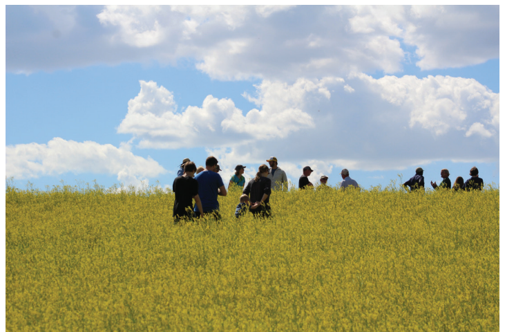
Images - All images by AERO from Touring the Underground, and include Prairie Heritage Farm, and the Manuel Ranch