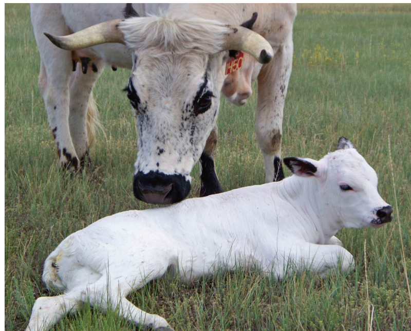
Images - Upper left: Touring the Underground. Lower right: White Park cow and calf at B-Bar Ranch.

Montana is in the early stages of establishing a commonly accepted definition for agritourism. However, the definition used in 2017 legislation addressing liability is as follows: “Agritourism” means a form of commercial enterprise that links agricultural production or agricultural processing with tourism in order to attract visitors to a farm, ranch, or other agricultural business for purposes of entertaining or educating the visitors. House Bill 342 was passed into law in March 2017, adding agritourism to the list of Montana Recreational Activities in which participants assume the liability for the inherent risks of those activities. For more information on insurance and liability, please see the Safety and Risk Management section of this resource site. At its heart, agritourism connects farms to communities. According to the state of Vermont, ‘it is the business of establishing farms as destinations for education, recreation, and the purchase of farm products.