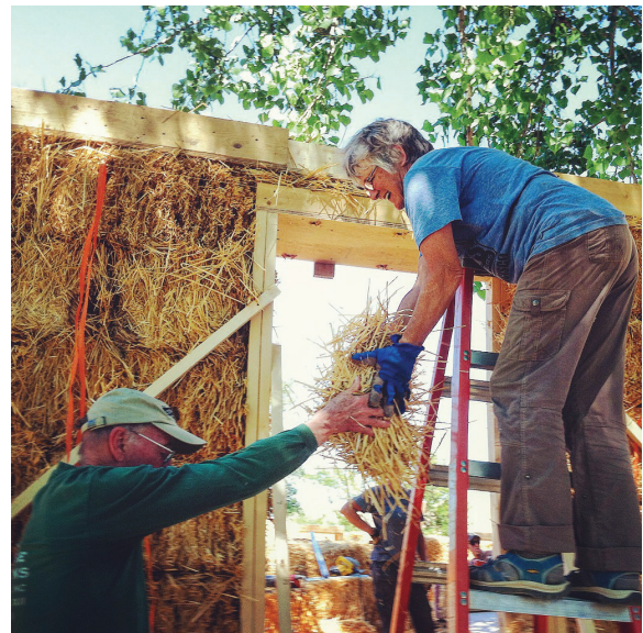
Images - Above: All images by AERO, from the corn harvest work party (Bob Quinn Ranch), the 2016 AERO Expo and Annual Meeting, with a sampling of carrot varieties from Fresh Root Farm, and the strawbale work party (River Ranch). Right: Inspecting new equipment at the Manuel Farm (by AERO).