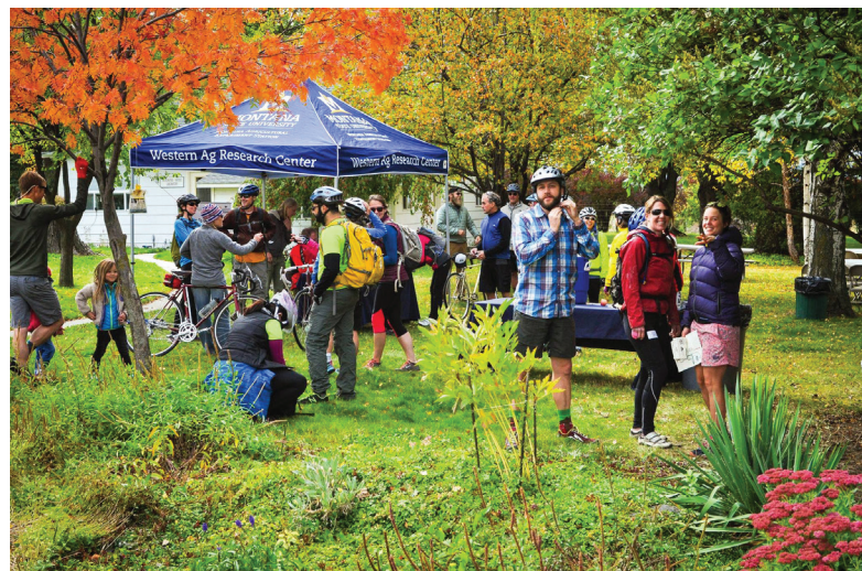
Images - Upper left: A hay-ride at Red Hen Farm in Missoula Lower right: Farm to Fork bike tour. Far right: Grapes after harvest at Spotted Bear Vineyard and Lavender Farm.

All of the above types of agritourism can help foster meaningful connections between the consumer and the farm. From that, long-term relationships can be forged. This customer loyalty and repeat business is key to the success of many agritourism businesses.