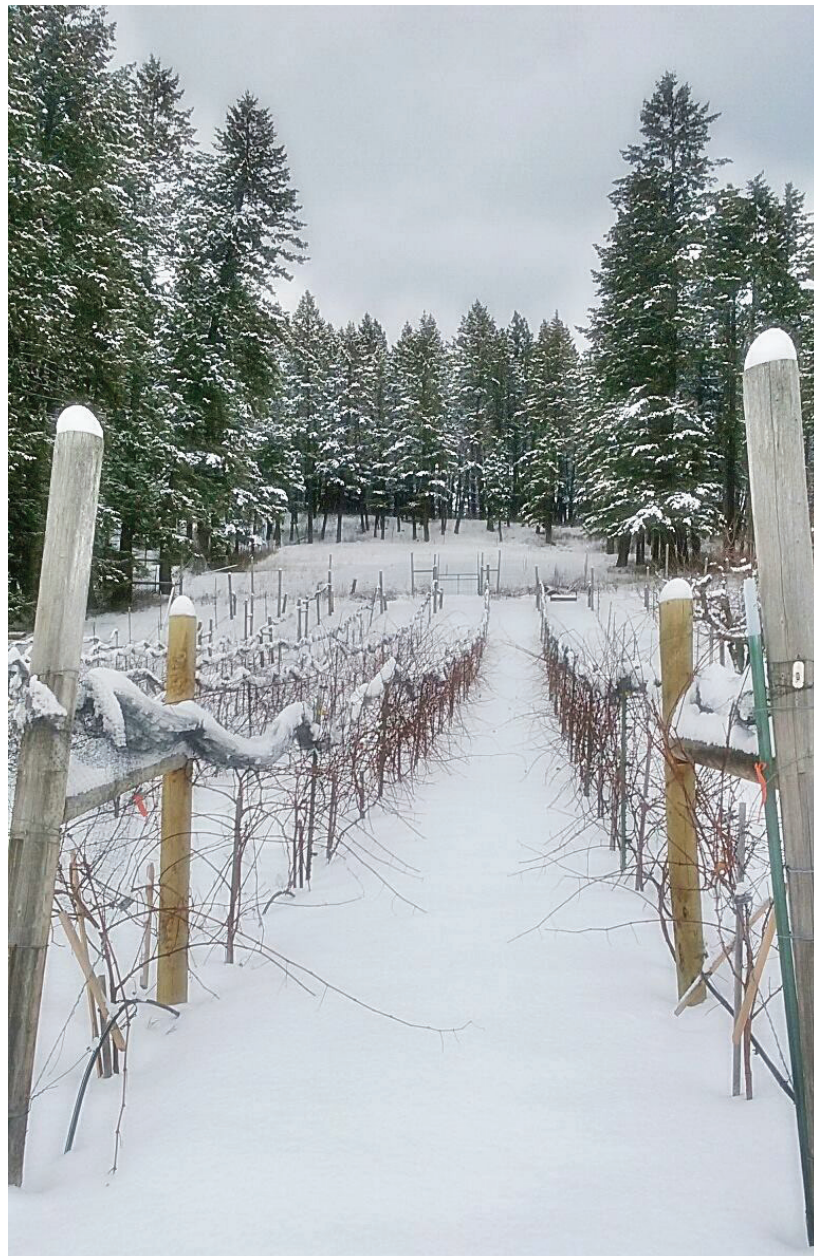
Image - The vineyard in winter at Spotted Bear Vineyard and Lavender Farm.

Marketing your Enterprise – University of California Cooperative Extension http://sfp.ucdavis.edu/agritourism/factsheets/market1/