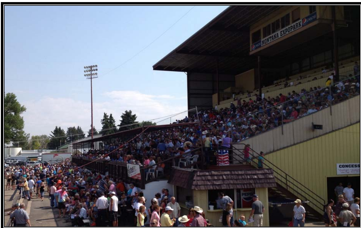
Picture taken July 27, 2013 – 3rd day of racing. Opening day the crowds were even larger.

With all the doom and gloom of previous years, it was proven that people still love to watch live horse racing. After two years of not racing in Great Falls, the newly formed Great Falls Turf Club, with financial support from the Cascade County Commissioners, presented a four (4) day race meeting leading into the 2013 Montana State Fair. The highly successful race meet handled $374,475 in 4 days , marking the highest total handle since 2005 when Great Falls handled $544,709 with 10 days of racing. “A picture tells a thousand words!”