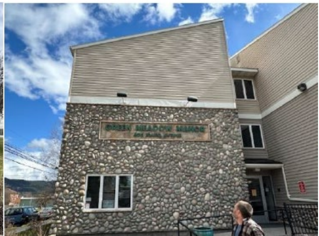
Green Meadow Manor